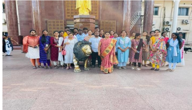
Students with Principal at The T.N.Dr.MGR Medical University